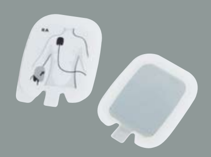
PRIMEDIC™ SavePads Connect (1 pair)