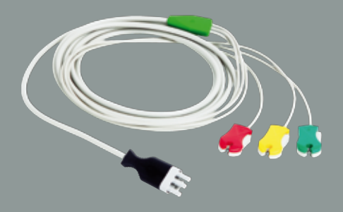
PRIMEDIC™ EKG patient cable 3 pole for connecting ECG electrodes for 6 channel ECG, including cables and plugs. Only for monitoring

Additional accessories available on request.