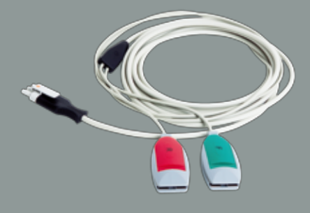
PRIMEDIC™ SavePads Connect cable, 2 pole for connecting PRIMEDIC™ SavePads Defibrillation electrodes for adults including cables and plugs